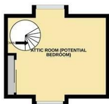
PAINTERS HILL BUNGALOW, WICK

Whilst every attempt has been made to ensure the accuracy of the floorplan contained here, measurements of doors, windows, rooms and any other items are approximate and no responsibility is taken for any error, omission or misstatement. This plan is for illustrative purposes only and should be used as such by any prospective purchasers. The services, systems and appliances shown have not been tested and no guarantee as to their operability or efficiency can be given. Made with Metropix C2024